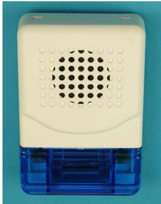
NB570 conventional (non-addressable) audio/visual alarm device